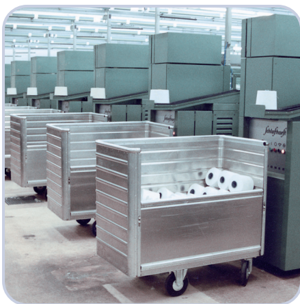
Cop, tube and bobbin transport