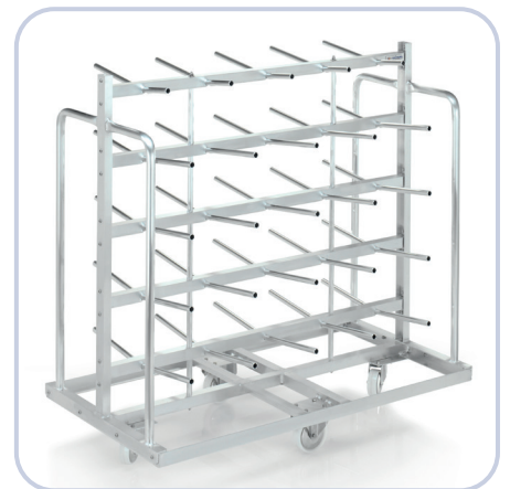
Bobbin trolley E42

More than 80 years Partner of the textile industry