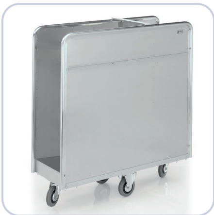
Roving bobbin trolley E41