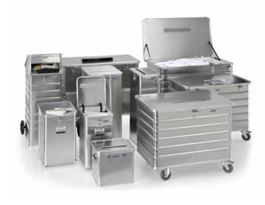
COUNT ON THE HIGHEST SECURITY!

Protect sensitive data reliably! With our GMÖHLING disposal containers, we guarantee secure collection and compliant transport for the destruction of sensitive data - in accordance with BDSG and GDPR, up to and including security level 3.