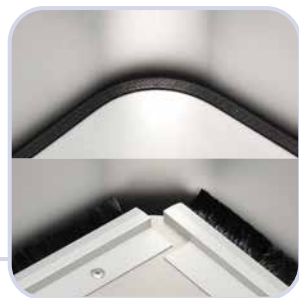
Narrower gap with plastic rim inlay or brush strip