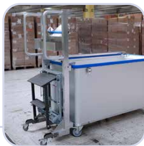
Ladder, push aid, drink holder, scanner holder, label dispenser, writing tablet or clipboard